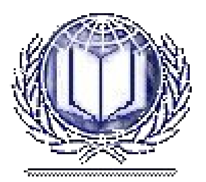
World eBook Library

The World eBook Library, <u>www.worldlibrary.net</u> is an effort to preserve and disseminate classic works of literature, serials, bibliographies, dictionaries, encyclopedias, and other reference works in a number of languages and countries around the world. Our mission is to serve the public, aid students and educators by providing public access to the world's most complete collection of electronic texts on-line as well as offer a variety of services and resources that support and strengthen the instructional programs of education, elementary through post baccalaureate studies.